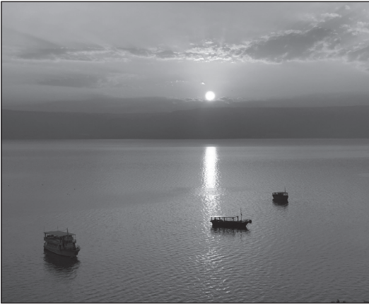
Top: A view from the Sea of Galilee looking toward (from left to right): Mount Arbel, Magdala, and Ginosaur.