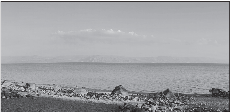
Bottom: From Tabgha on the north shore of the Sea of Galilee, looking south as the sun was preparing to set.